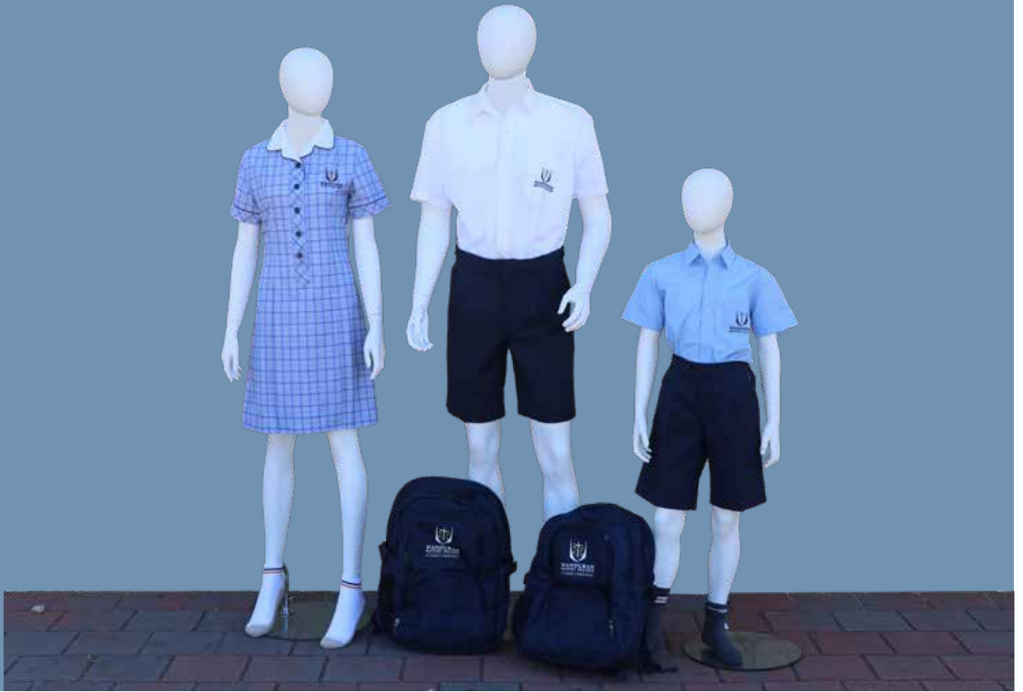
Students Year 3 to Year 12 — Summer Uniform