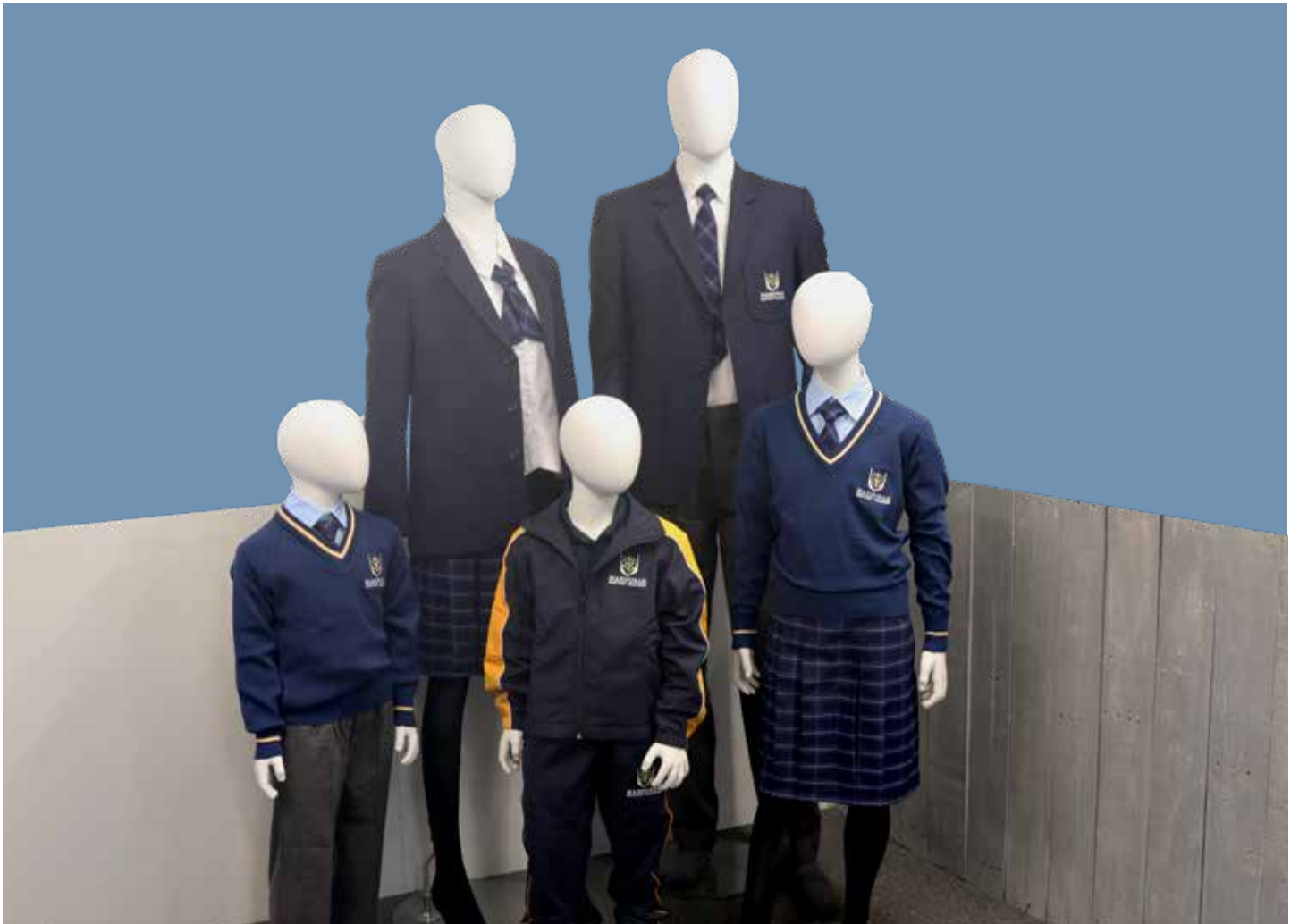
Students Year 3 to Year 12 — Winter Uniform