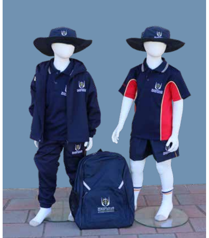
Kindergarten to Year 2 — Uniform

Shoes should be comfortable, supportive sneakers. They are permitted to be lace-up or Velcro.