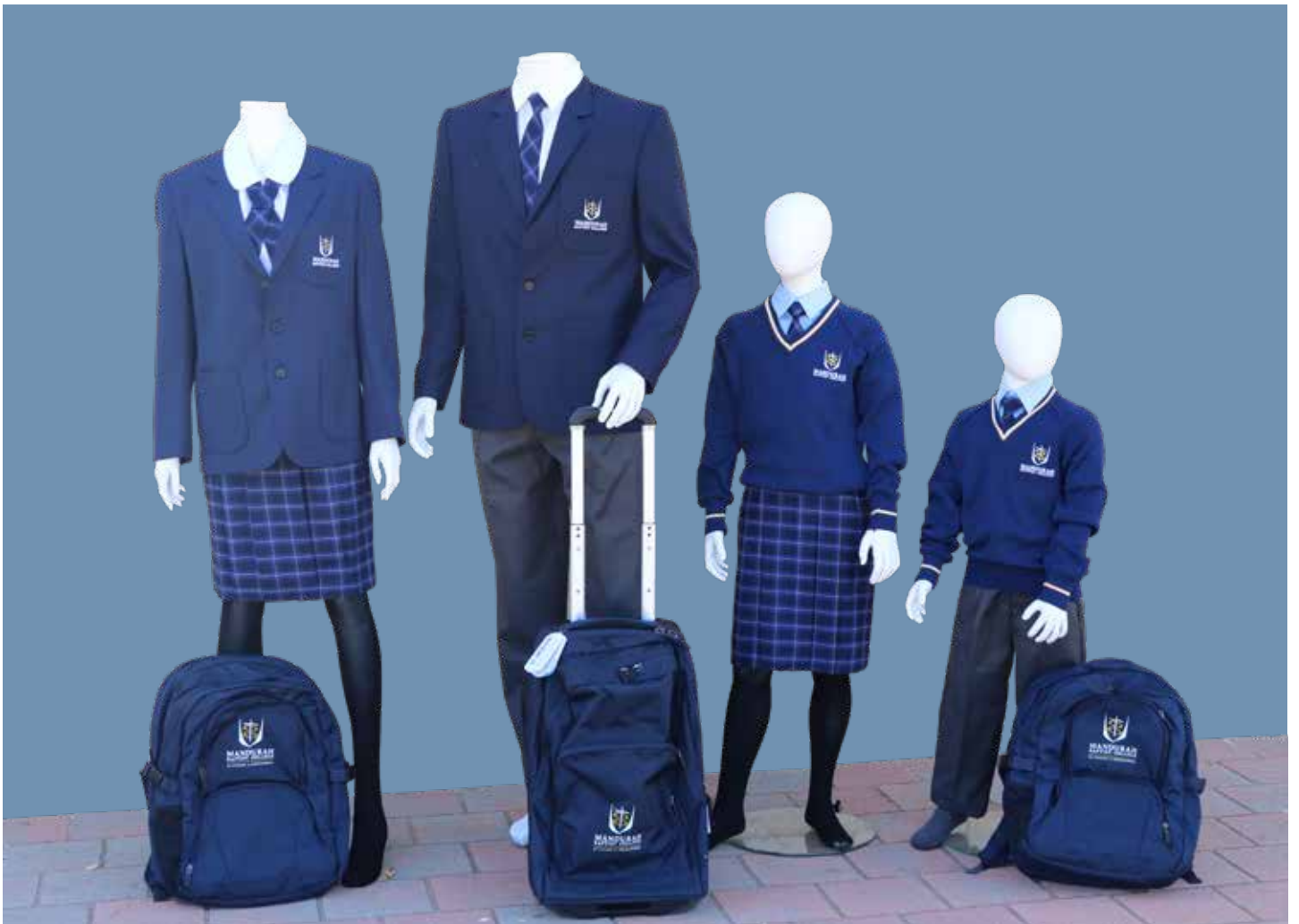
Students Year 3 to Year 12 — Winter Uniform