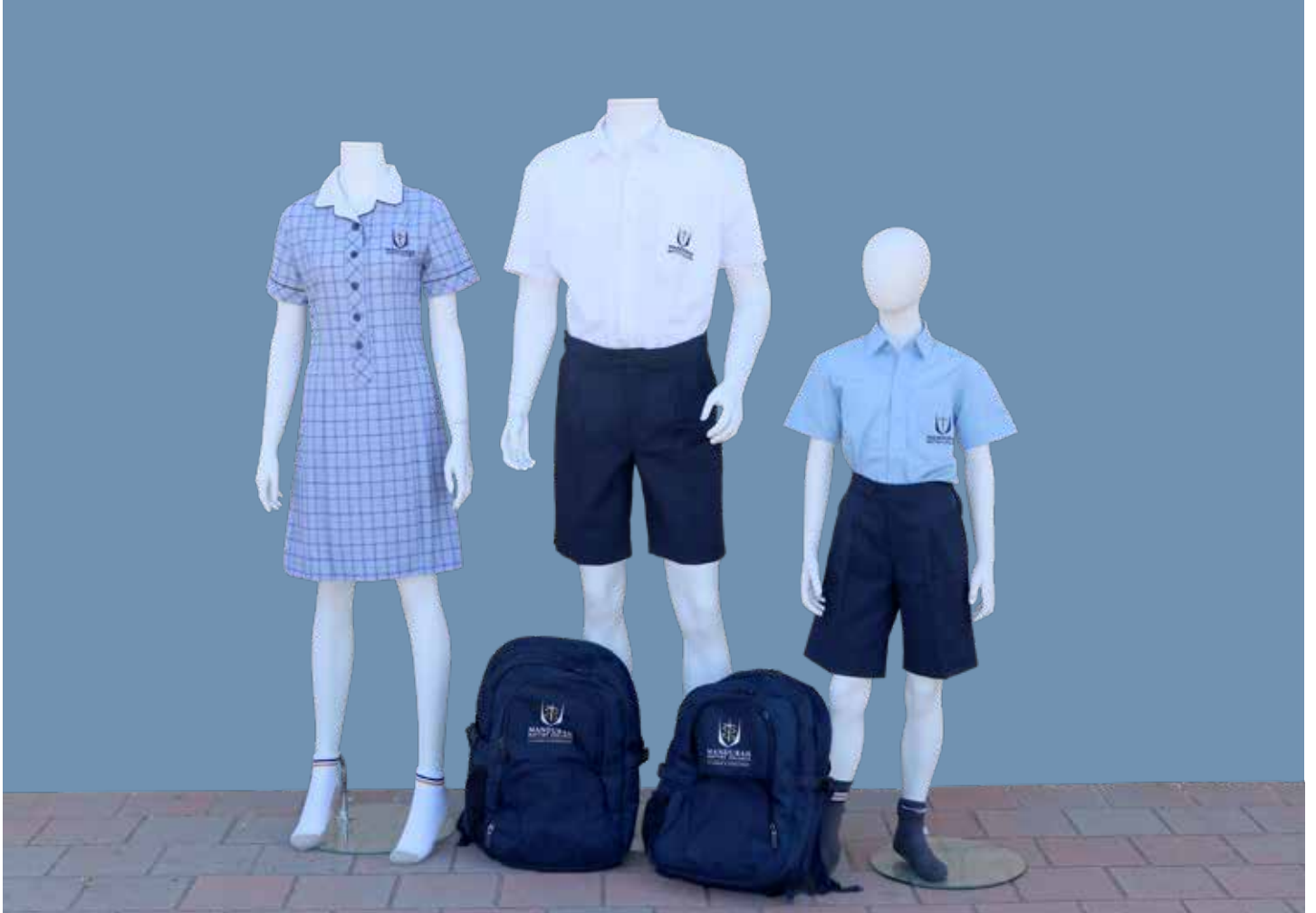
Students Year 3 to Year 12 — Summer Uniform